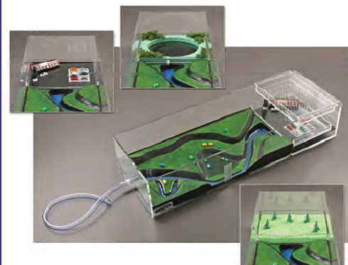
Stormwater model for use in public outreach and education. See page two.